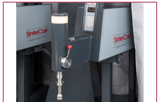
Figure 3: Re-engineered SAM with improved Thermocouple Holder