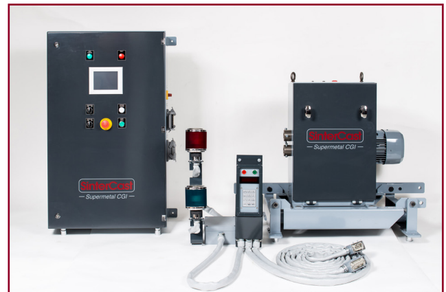
Figure 4: Automatic Wirefeeder, including Wirefeeder Head, Control Cabinet, Operator Box and Signal Lamp Assembly