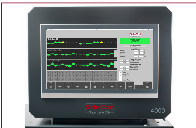
Figure 2: Larger graphical OCM display for user-friendly operator interaction