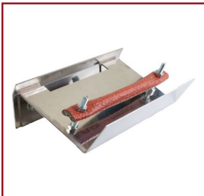
RFID Ladle Tag Holder Set