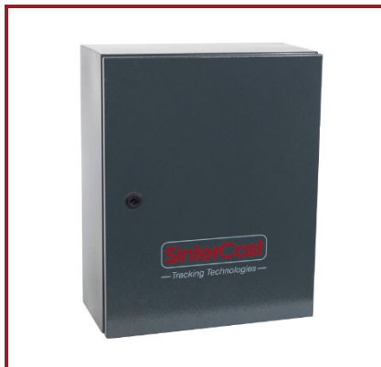
Tracker Reader Module