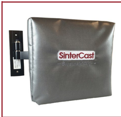
Tracker Antenna Set