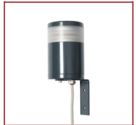
Tracker Signal Lamp