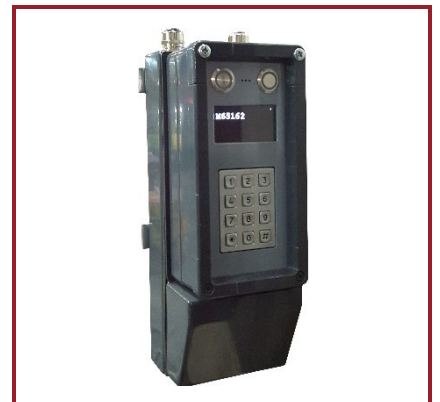
Tracker Operator Box Module

More information, more control, more efficiency, more profit Less scrap, less frustration, less energy, less CO 2