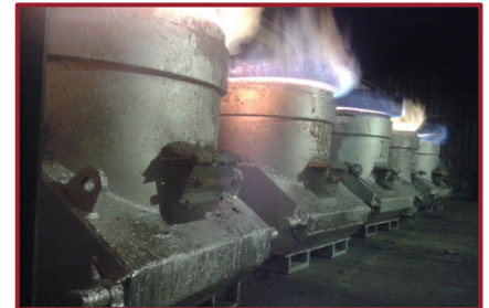
Figure 1: RFID Ladle Tags affixed to each ladle

Summary reports can be independently created on a daily, weekly, monthly or on-demand basis. The Ladle Tracker Summary Report is customised for each foundry to detail the average start time at each tracking position, together with elapsed times for every step in the process, including the locations where ladles fall out of the process. The process flow data provides information that enables the production performance to be measured. Bottlenecks can be identified and eliminated, while process KPIs can be established and measured for each shift.