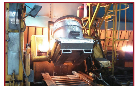
Figure 2: Measurement and control at every critical process step