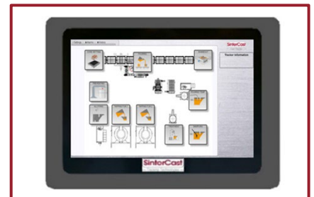
Figure 3: On-line process control and traceability