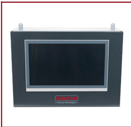
Tracker Computing Module