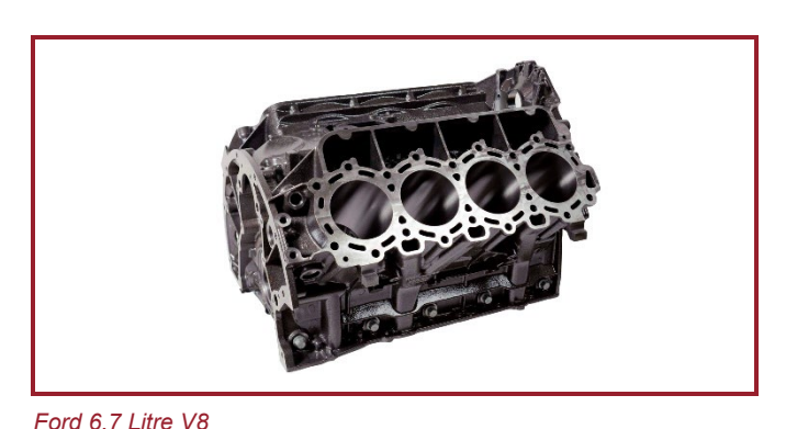
Ford Super Duty Pick-up Trucks