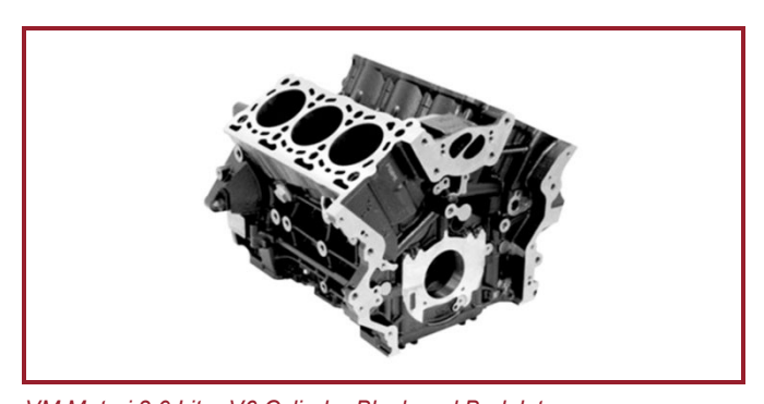
VM Motori 3.0 Litre V6 Cylinder Block and Bedplate Chrysler, Jeep, Lancia, Maserati and Ram