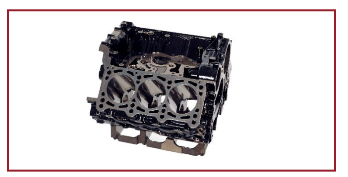
Audi 3.0 Litre V6 Audi, Porsche and Volkswagen

SinterCast supports series production and product development of passenger vehicle cylinder blocks in Europe, Asia and the Americas. SinterCast-CGI engines have been made available in more than 50 vehicles in 18 car brands.