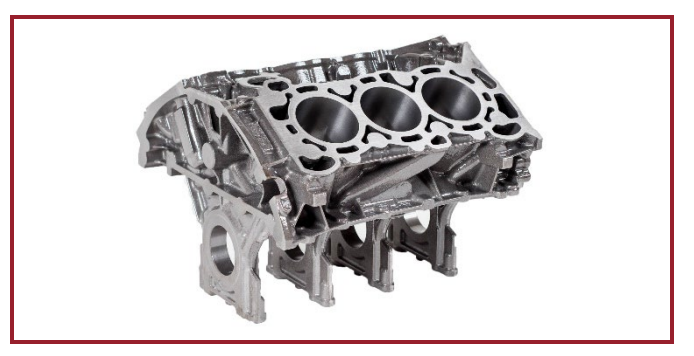
Ford 2.7 and 3.0 Litre V6 Petrol Ford and Lincoln