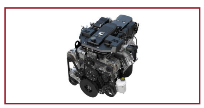
Cummins 6.7 Litre In-Line 6 Ram Heavy Duty Pick-up Trucks