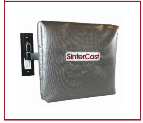
SinterCast Tracking Technologies

SinterCast<sup>®</sup> is the world's leading supplier of process control technology for the reliable high volume production of Compacted Graphite Iron (CGI). The properties of CGI enable improved transport solutions, increasing efficiency and reducing carbon emissions in passenger vehicle, commercial vehicle and industrial power applications. As a specialist supplier of precision measurement and process control solutions to the metals industry, SinterCast also supplies the SinterCast Ladle Tracker<sup>®</sup> and SinterCast Cast Tracker<sup>®</sup> technologies, to improve production efficiency and Industry 4.0 traceability in a variety of applications. With 57 installations in 13 countries, SinterCast is a publicly traded company, quoted on the Small Cap segment of the Nasdaq Stockholm stock exchange (SINT).