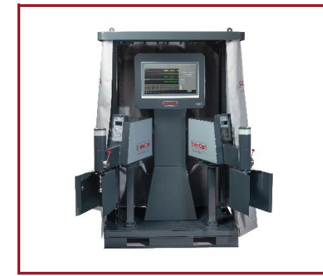
Automated System 4000 Fully Automated Series Production

Hyundai, Korea (Ladle Tracker) IronCast, Mexico (Ladle Tracker) Poitras, Canada (Ladle Tracker) Scania Classic, Sweden (Cast Tracker) Tupy Joinville, Brazil (Ladle Tracker) Tupy Saltillo Line 3, Mexico (Cast Tracker) Tupy Saltillo Line 3, Mexico (Ladle Tracker)