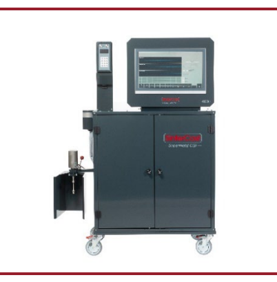
Mini-System 4000 Niche Volume Production, Product Development and R&D